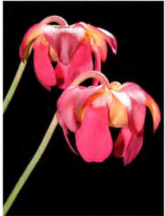
Figure 8: 'Premysl Otakar I' flowers.